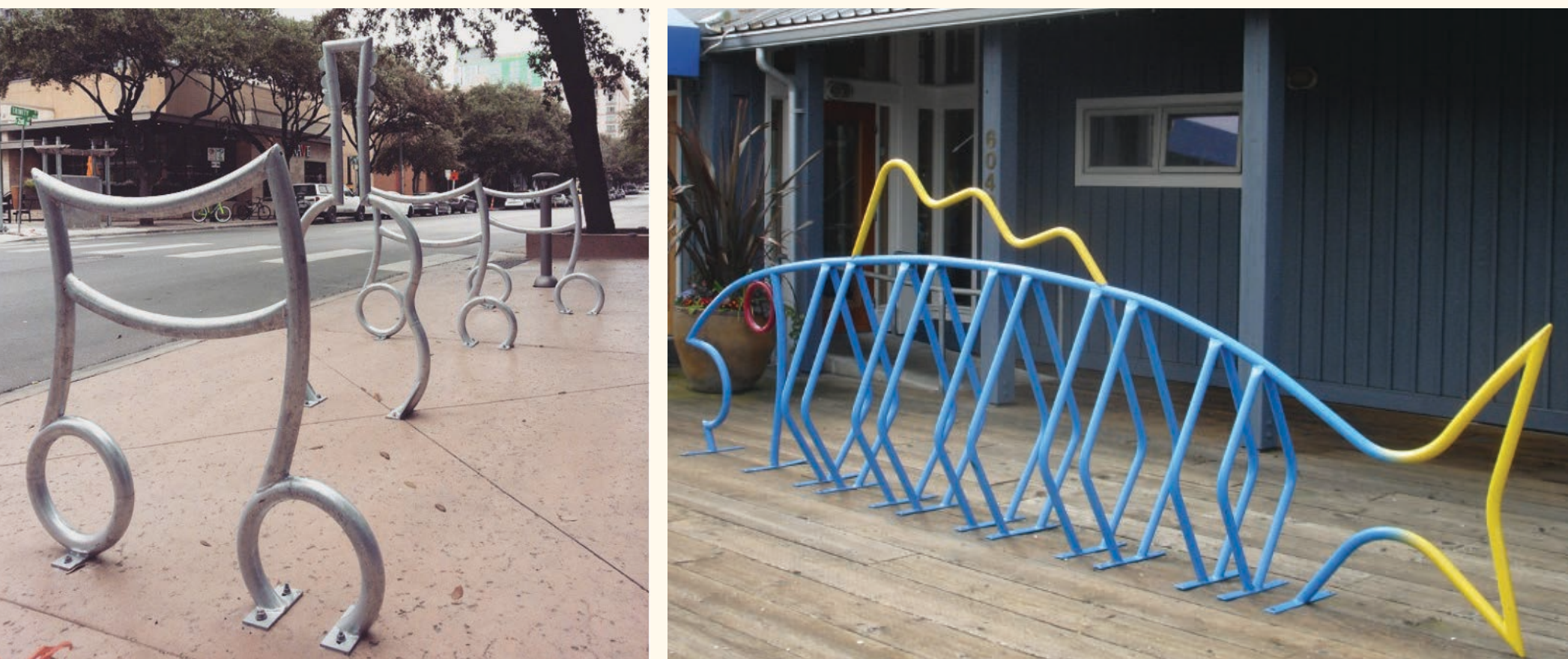
Thematic bike racks (Austin, TX, Seattle, WA)