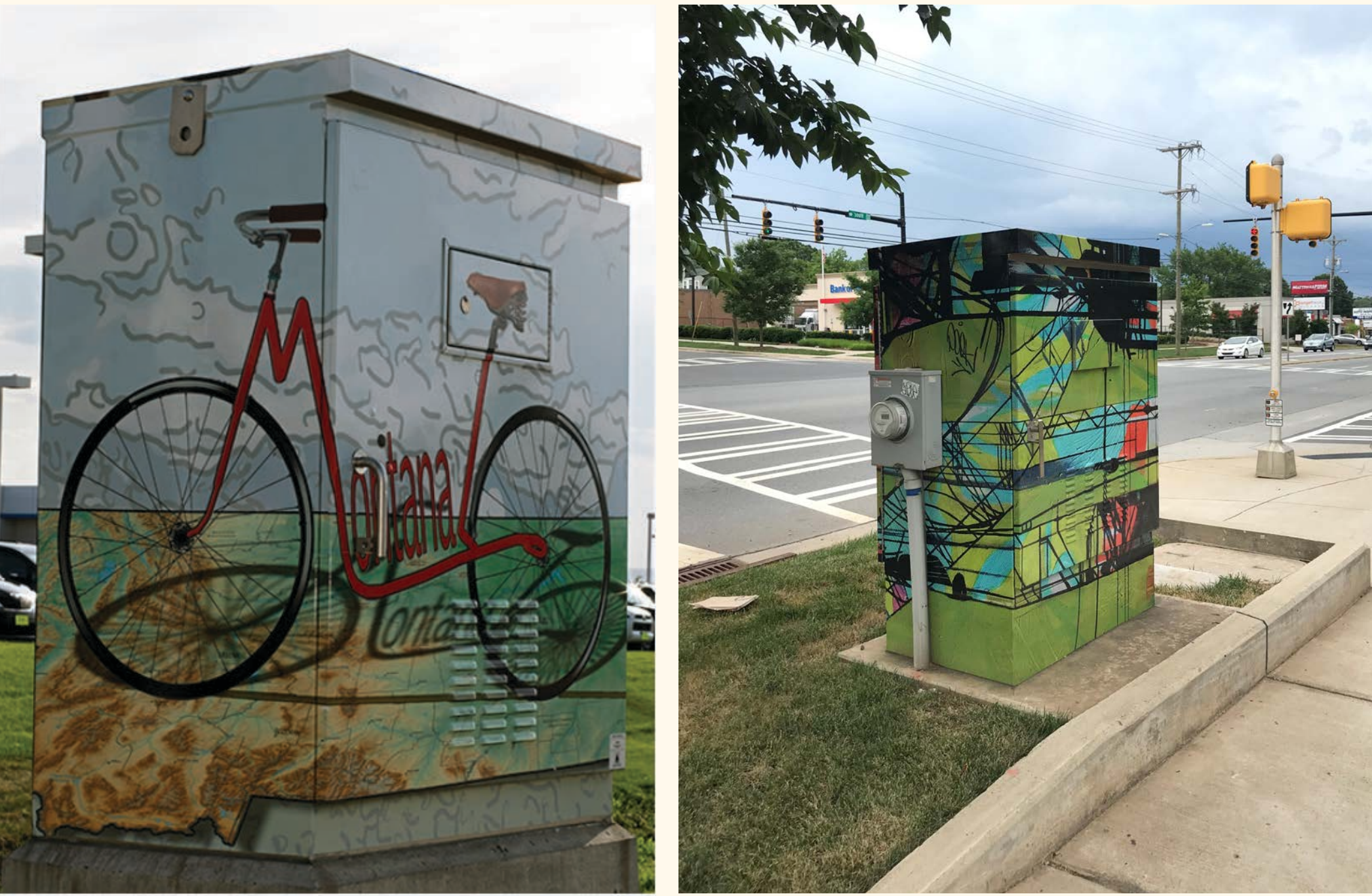
Different artists commissioned to wrap utility boxes with custom artwork (Bozeman, MT, Charlotte, NC)