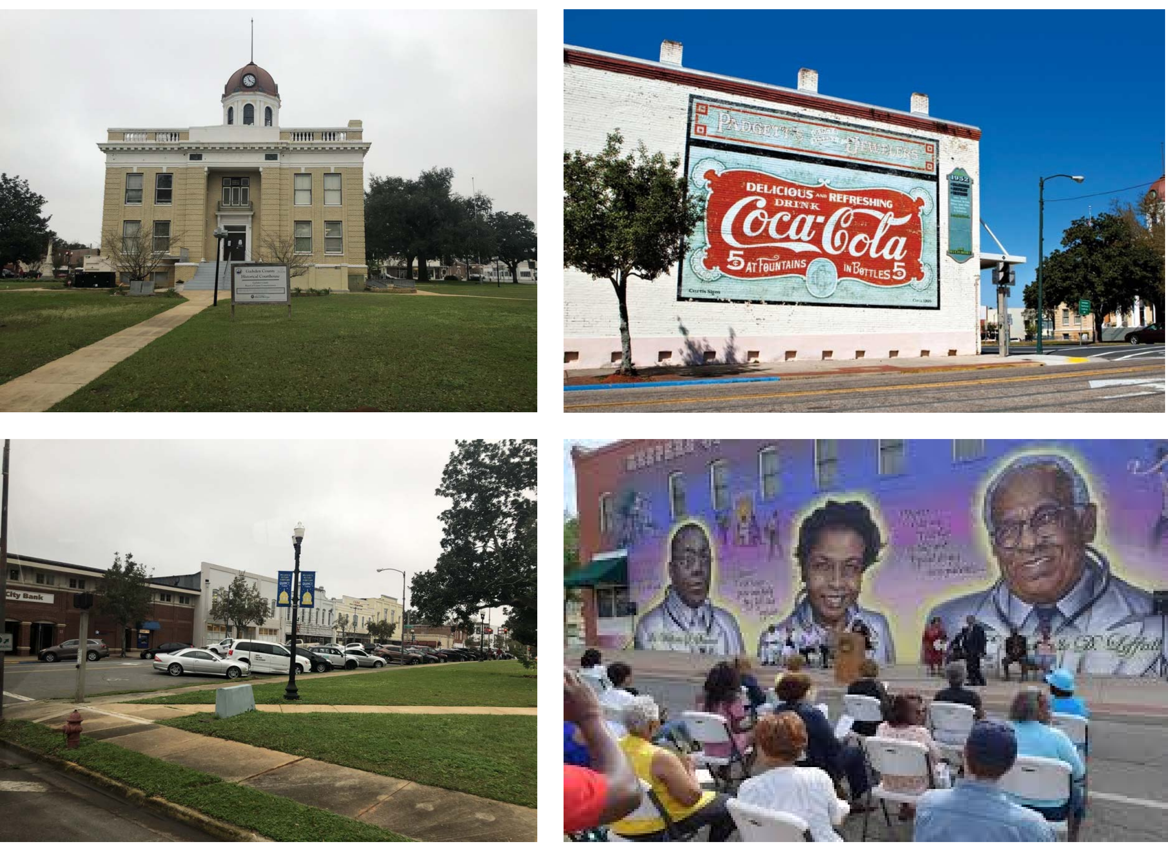
The historic courthouse and outdoor murals are important features of Quincy's downtown landscape.