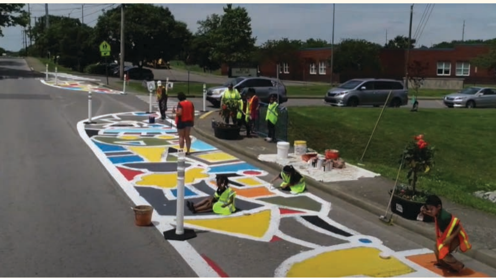
Street mural at Amqui Elementary School Street Mural near Nashville, TN

The designs can be supplemented by placemaking strategies, such as the examples below, that incorporate local character and artwork to reinforce the city's identity.